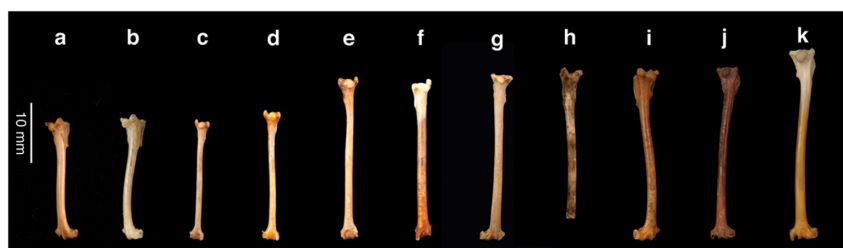
Figure 1 | Bat humeri. (a), (c), (e), (g), and (j) are late Holocene fossils from Ralph's Cave, Abaco. (h) is a late Holocene fossil from Trouing Jeremie, Haiti. (b), (d), (f), (i), and (k) are modern specimens. Monophyllus redmani (a, b). Myotis austroriparius (c, d). Lasiurus borealis cf. minor (e, f). Natalus primus (g). Macrotus waterhousii (h, i). Pteronotus parnellii (j, k). Mo. redmani UF 14826, Haiti (b). My. austroriparius UF 24049, Florida (d). L. borealis cf. minor UF 30161, Florida (f). Ma. waterhousii UF 20812, Haiti (i). P. parnellii UF 6947, Guatemala (k).

Modern and Past Locality Records. The three focal species of bat vary in their modern and past distributions (Supplementary Fig. S1). We compiled 168 modern localities and 41 fossil localities for Ma. waterhousii (Supplementary Fig. S1), which occurs today throughout The Bahamas, Cuba, Hispaniola, and Jamaica, and has been documented as a fossil on Puerto Rico, Anguilla, and Antigua 1,5,10,24,25 . We compiled 143 modern and 16 fossil localities for Mo. redmani (Supplementary Fig. S1), which now occurs in the Greater Antilles, Crooked and Acklins Islands (The Bahamas), and the Turks and Caicos Islands 26 , with a fossil record from Abaco (herein). We compiled 115 modern and 13 fossil localities for P. parnellii (Supplementary Fig. S1), which currently occurs throughout the Greater Antilles 27 and also is widespread on the mainland from Mexico to Brazil 28 ; it formerly occurred on Abaco and on Antigua 10,21,29 (also see Results herein).